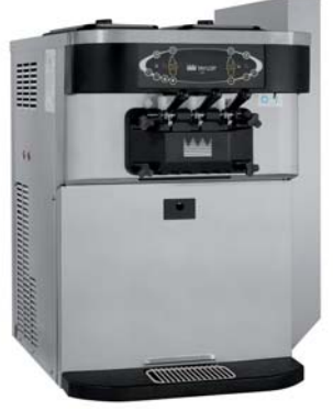
Shown with optional top air discharge chute.

During long no-use periods, the standby feature maintains safe product temperatures in the mix hopper and freezing cylinder.